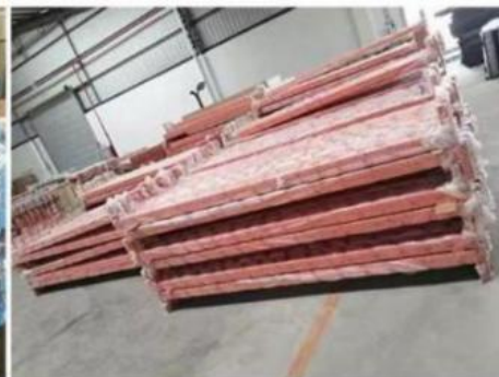
Package for Beam