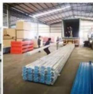
Loading for Upright Frame