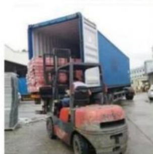
Loading for Beam