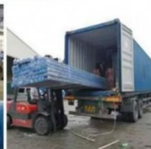
Loading for Wire Mesh Cage