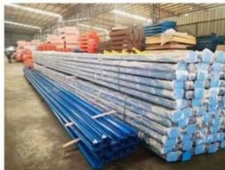
Package for Upright Frame